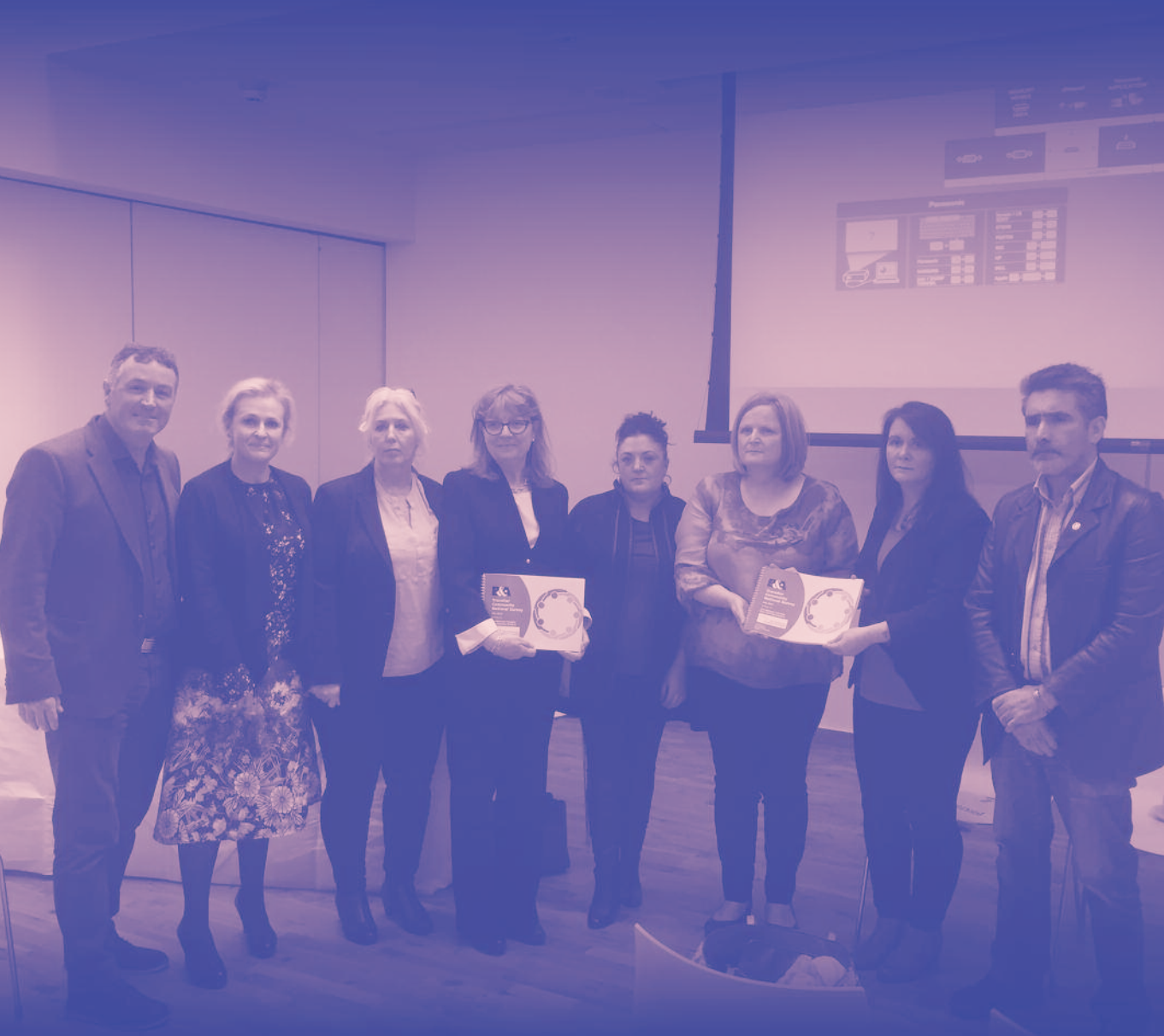
Launch of the Behaviour and Attitudes Research in the Morrison Hotel