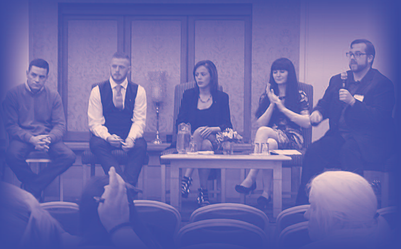
ITM AGM Tullamore